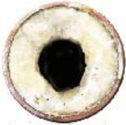
Scale buildup in a pipe, caused by hard water.

The amount of dissolved calcium and magnesium in water determines its "hardness." Where the water is relatively hard, you may notice that it is difficult to get a lather up when washing your hands or clothes. And, industries might have to spend money to soften their water, as hard water can damage equipment. Hard water can even shorten the life of fabrics and clothes. As per IS the Hardness of drinking water should be less than 300ppm.