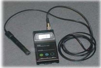
Meter to measure specific conductance in the field and lab

(such as salt) in the water. Pure water, such as distilled water, will have a